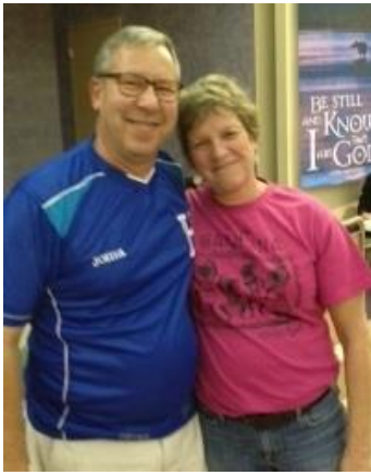
1st Place Soup Cose Family