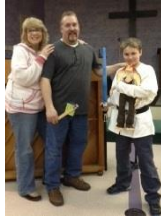
2nd Place Decorations Zing Family